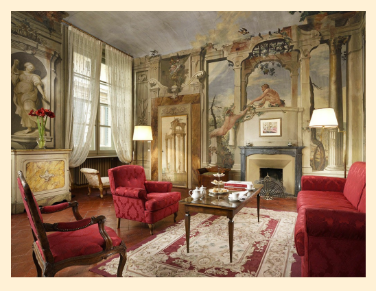
FALL 2024 Please Join Grace Grillo Escorted Destination Experience

We request a $500 deposit per person. 50% of the balance due 5 months prior and balance is due 90 days prior. All payments are refundable up to 90 days prior to departure. Accepted forms of payment: Zelle, Venmo & Credit Cards. 3.5% additional service fee for credit cards. We suggest travel insurance. (Airfare/Airport transfers are not included) We offer airport transfers at an additional expense.