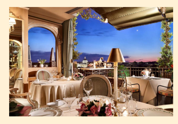
Special Travel Agent Price: $3299 Per Person Double Occupancy $4199 Per Person Single Occupancy

Start Date: 30 Oct 2024 9 Nights / 10 Days Arrival: Fiumicino, Rome Departure: Venice